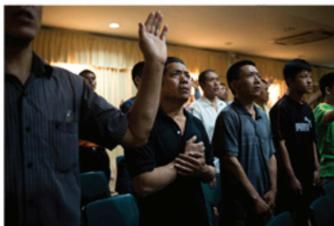
Migrant workers worshipping in Singapore