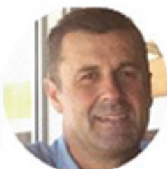
Australian and International Training Director