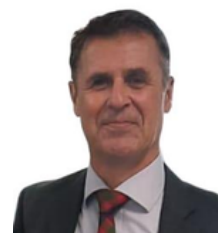
International Training and Communications Director